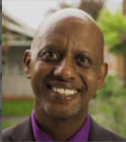
Sen. Kayse Jama Senate District 24