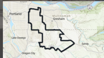
Multnomah County (Portion)