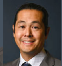
Rep. Hai Pham House District 36